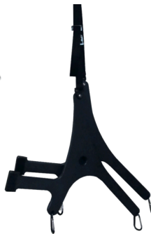
Stand-Offs VPN: 55711 2.4 lbs