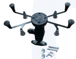
Splice Tray Holder VPN: 55725 .51 lbs