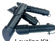
Leveling Kit VPN: 55742