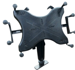
Tablet Holder VPN: 55720 1.7 lbs