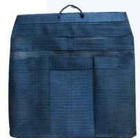
Black Poly-Mesh 3-Pocket Pouch VPN: 55710 .15 lb