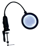
LED Dual Power Light with Magnifying Glass VPN: 55615 1.45 lbs