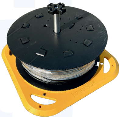
(Shown with Turntable Spindle Accessory)