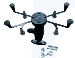
Splice Tray Holder VPN: 55725 .51 lbs