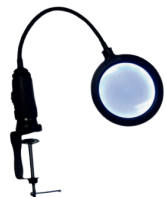
LED Dual Power Light with Magnifying Glass VPN: 55615 1.45 lbs