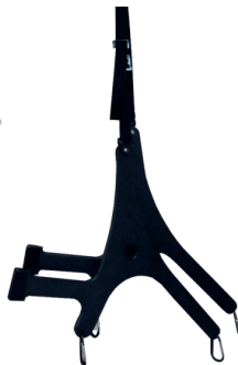
Stand-Offs VPN: 55711 2.4 lbs