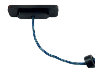
Splicer Seat Tether VPN: 55745 5 oz