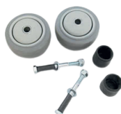
Wheel Kit VPN: 55740 10 oz