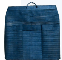
Black Poly-Mesh 3-Pocket Pouch VPN: 55710 .15 lb