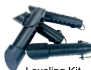
Leveling Kit VPN: 55742