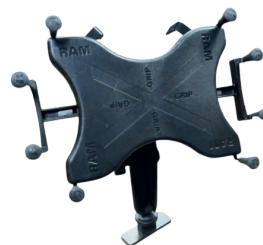
Tablet Holder VPN: 55720 1.7 lbs