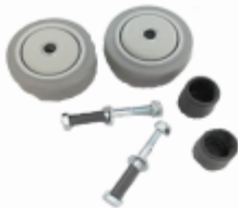
Wheel Kit VPN: 55740 10 oz