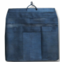
Black Poly-Mesh 3-Pocket Pouch, VPN: 55710 .15 lb