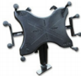
Tablet Holder VPN: 55720 1.71 lbs