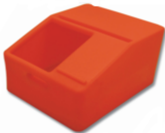
Splicer Seat VPN:55430-OR 10 lbs