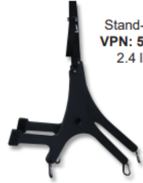
Stand-Offs VPN: 55711 2.4 lbs