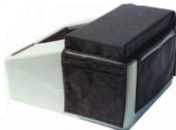
Tool Saddle with Pocket VPN:558430-CU-BLK 14 oz