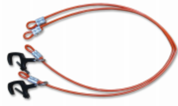
Aerial Strand Cables, VPN: 55715 1 lb