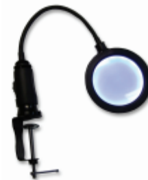
LED Dual Power Light with Magnifying Glass, VPN: 55615 1.45 lbs