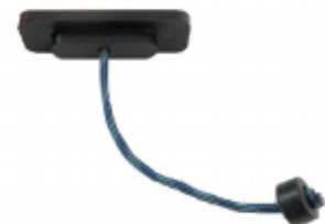
Splicer Seat Tether VPN:55745 5 oz